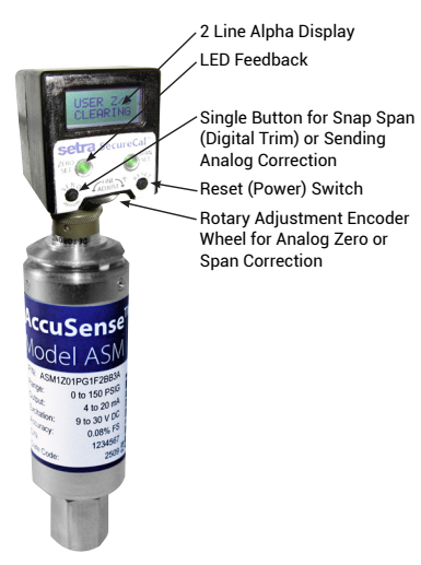
Diagram 2: Pressure Ranges/Proof Pressure Specifications

Span or full scale output adjustments should only be performed by using an accurate pressure standard (electronic calibrator, dead weight tester, digital pressure gauge, etc.) with greater or at least comparable accuracy to the ASM transducer. With full range pressure applied to the high pressure port, the span may be adjusted by pressing the send button to set span. If fine adjustment is needed on span, and control pressure is applied at full pressure range, turn encoder until target correction is achieved on LCD then press send button.